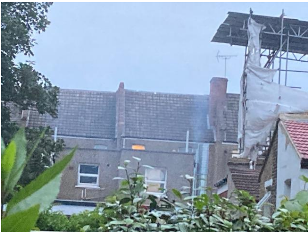
Doorway between the rear of 365-369 Green Lanes and 145 Lothair Road North